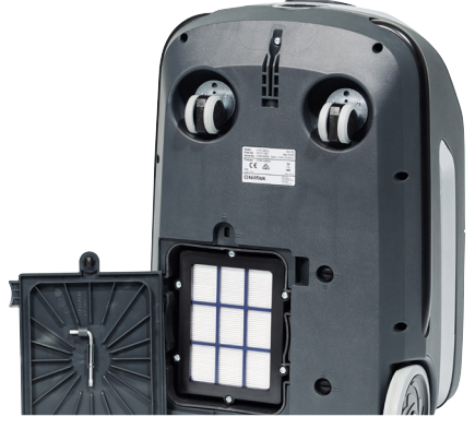
HEPA H13 exhaust filter is standard on all VP600 Battery variants