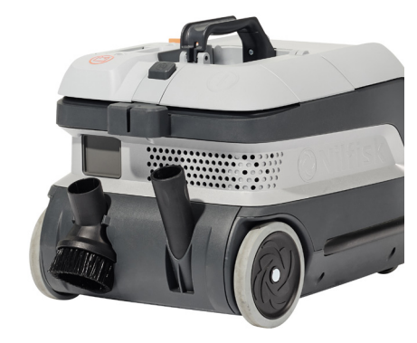
User friendly and easy to reach accessories