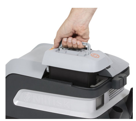
Easy access to the battery pack makes re-charging and change of battery a simple procedure