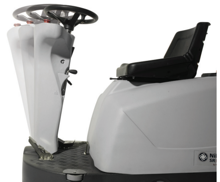
The steering column adjusts for easy access to the machine and for maximum operator comfort