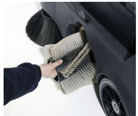
The filter and brushes can be accessed quickly and easily without tools for service and replacement