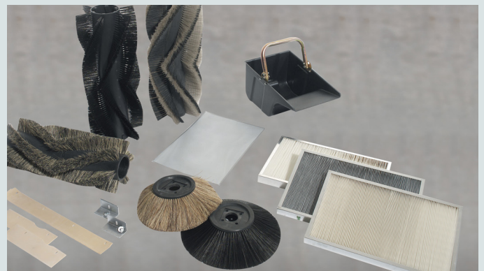
Large range of optional accessories provides the right tools for specific jobs e.g. carpet kit, special filters and brushes, overhead guard, 2x18 litres hopper containers etc.