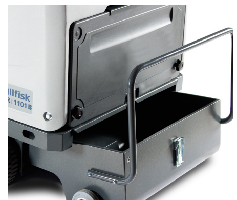
The hopper capacity is extremely large to extend operational time