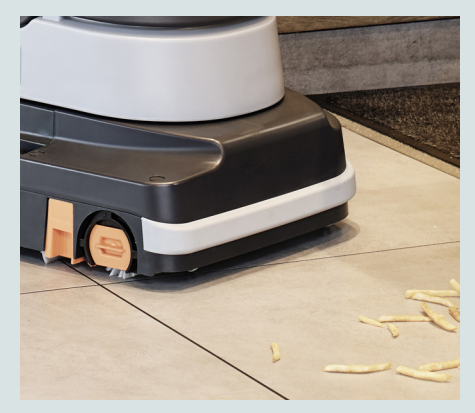
Easy pick-up of larger debris as front squeegee can be lifted