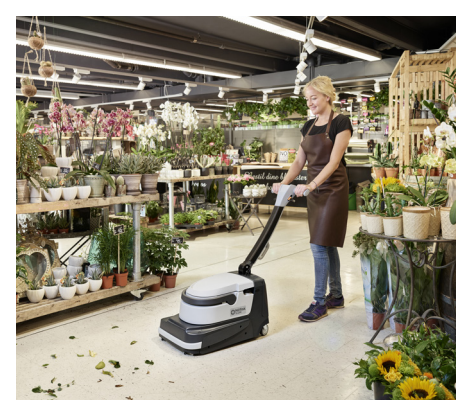
Cleaning floors with ease and speed - sweep, scrub and dry at the same time