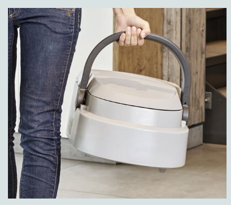
Tank-in-tank design for easy handling when emptying and refilling