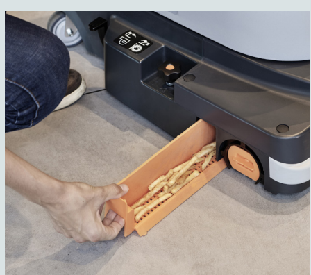
Easy access to emptying and cleaning the debris tray