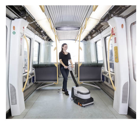
Easy to maneuver thanks to its pivoting wheels and the ergonomic adjustable handle